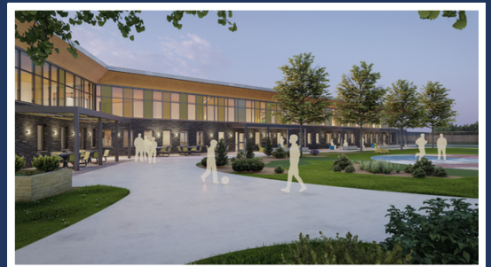
IYC Lincoln renderings